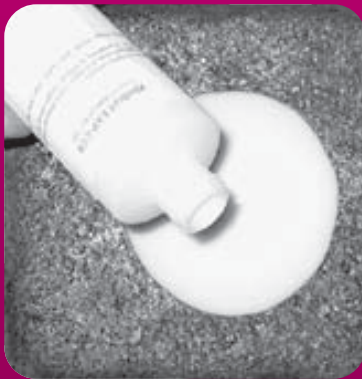
1. Pour Oil Stain Remover on stained area

NOTE: Severe stains may require more than one application. Humidity may affect dry time. Does not work below 55° F. For best results, apply in temperatures above 60° F. Do not allow unused product to freeze.