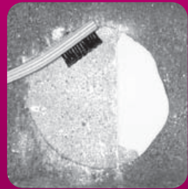
3. Brush away